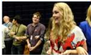
Peer Assisted Study Sessions